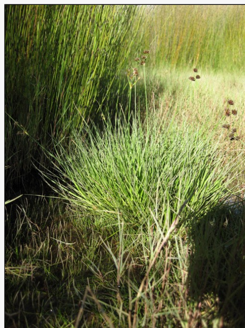
Caption: Juncus sonderianus