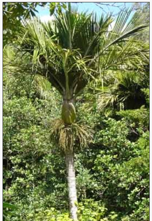
Caption: Raoul Island