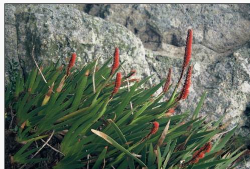
Caption: Tatua Peak

http://nzpcn.org.nz/flora_details.asp?ID=706