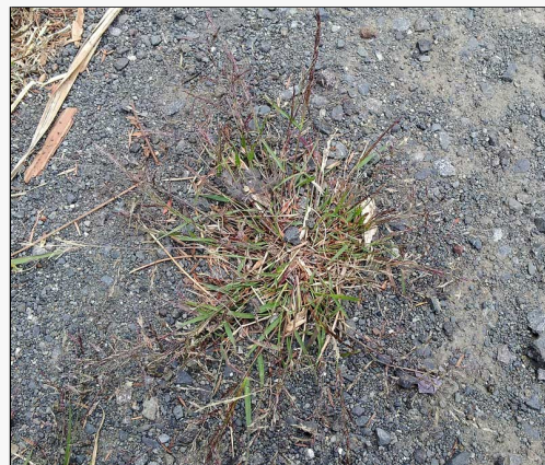
Caption: Huia Road, Waitakere.