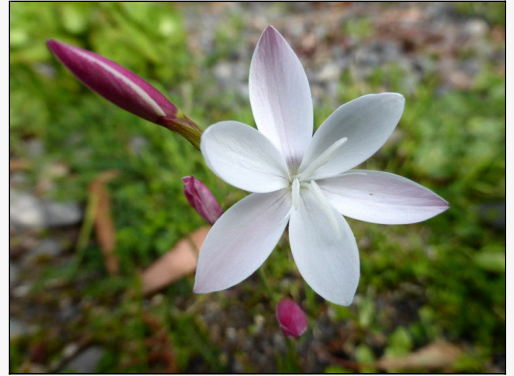
Caption: White tepals with outer 3 purple on outer surfaces; plant in infrequently mown lawn, Whanganui

http://nzpcn.org.nz/flora_details.asp?ID=7702