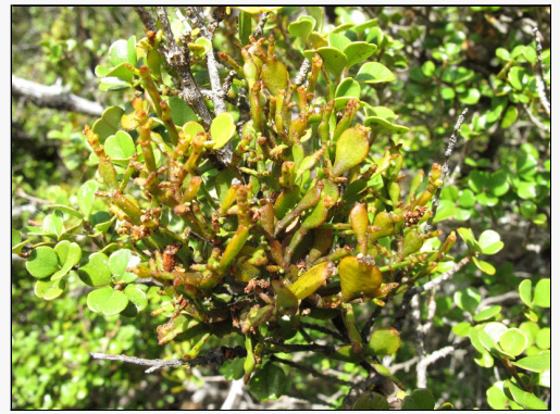
Caption: Stevensons Island, Lake Wanaka

http://nzpcn.org.nz/flora_details.asp?ID=884