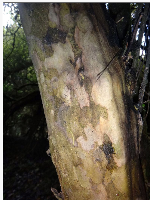
Caption: Leitz's Gully, Otago

http://nzpcn.org.nz/flora_details.asp?ID=1741