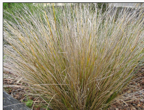
Caption: Carex strictissima

http://nzpcn.org.nz/flora_details.asp?ID=97