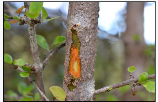
Caption: Landsborough Valley