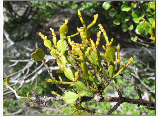
Caption: Stevensons Island, Lake Wanaka