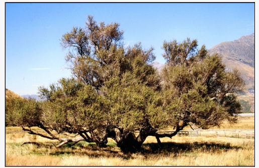
Caption: Tree in Matukituki Valley

http://nzpcn.org.nz/flora_details.asp?ID=115