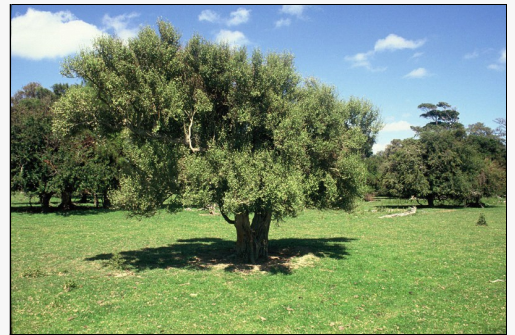
Caption: Swales Bush Scenic Reserve