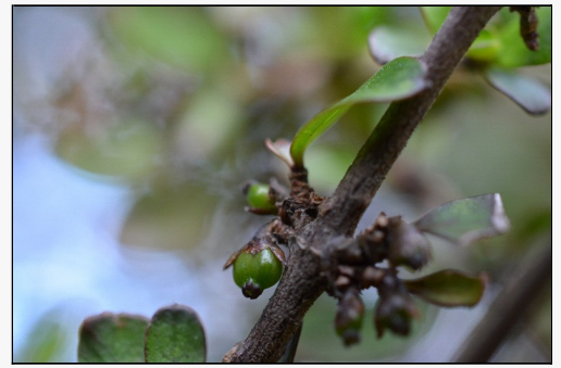
Caption: Landsborough Valley

http://nzpcn.org.nz/flora_details.asp?ID=159