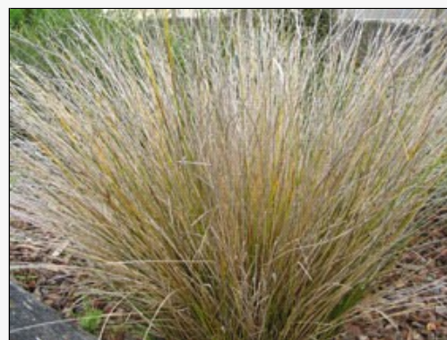
Caption: Carex strictissima