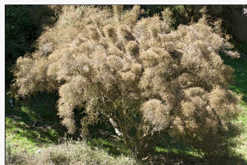
Caption: Mangatoetoe Stream, Palliser Bay.