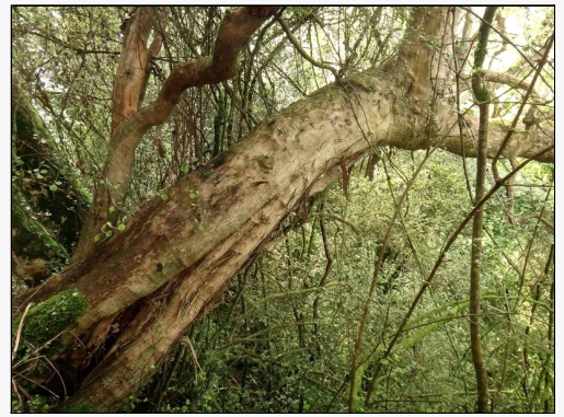
Caption: Leitz's Gully, Otago

http://nzpcn.org.nz/flora_details.asp?ID=293