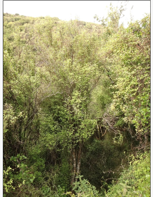
Caption: Leitz's Gully, Otago