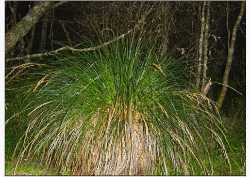
Caption: Carex secta (Purei)