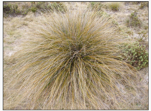
Caption: Porters Hut, Red Hills, Richmond Forest

http://nzpcn.org.nz/flora_details.asp?ID=1673