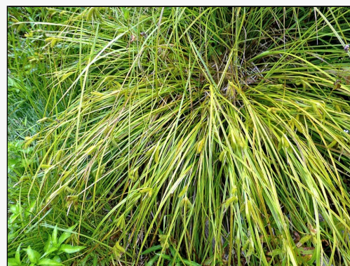
Caption: Lake Westmere, Whanganui. Feb 2013.

http://nzpcn.org.nz/flora_details.asp?ID=1414