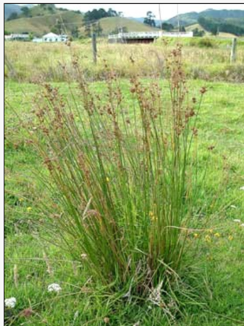
Caption: Juncus edgariae

http://nzpcn.org.nz/flora_details.asp?ID=869