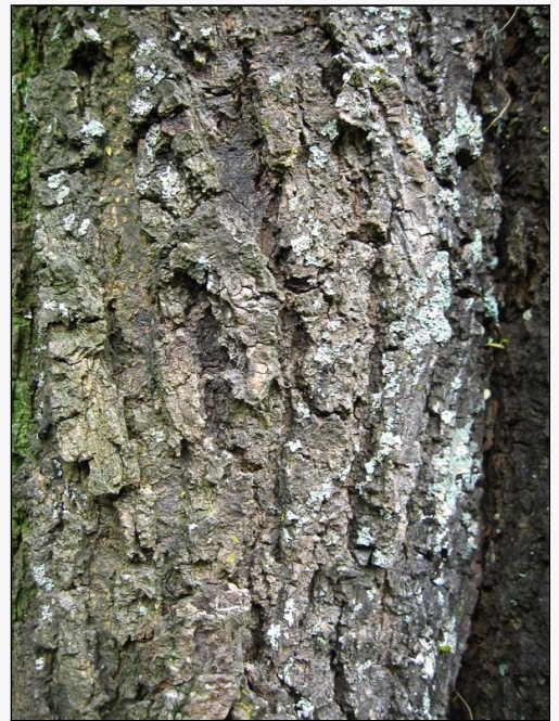
Caption: Bark, Dunedin Botanic Gardens

http://nzpcn.org.nz/flora_details.asp?ID=1302