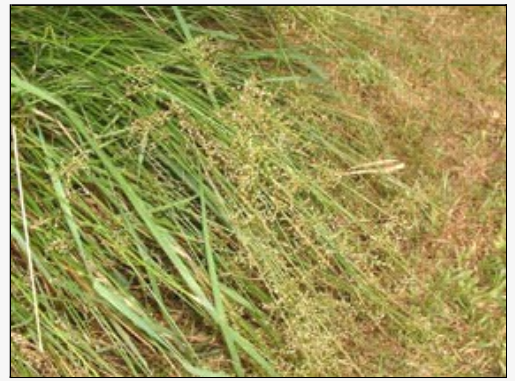
Caption: Coromandel, January

http://nzpcn.org.nz/flora_details.asp?ID=872