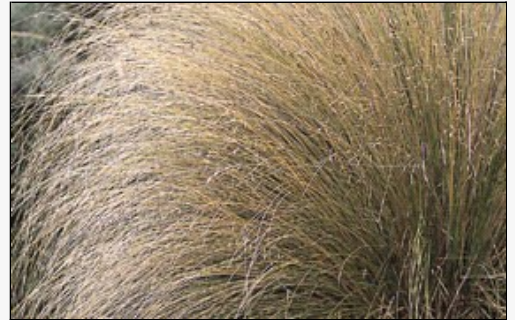
Caption: In cultivation. Dec 2001.