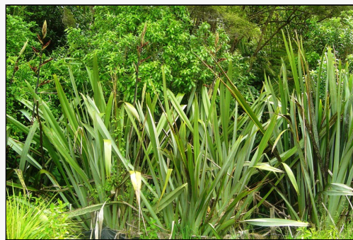
Caption: Phormium tenax

http://nzpcn.org.nz/flora_details.asp?ID=2219