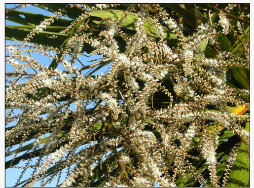
Caption: Awhitu Regional Park, Auckland region

http://nzpcn.org.nz/flora_details.asp?ID=1744