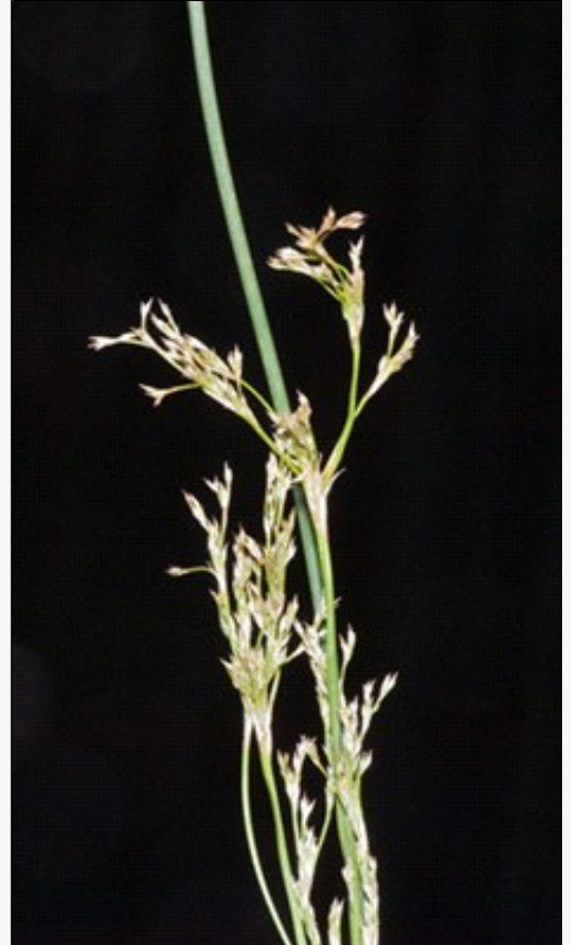
Caption: In cultivation. Oct 2007. Inflorescence.