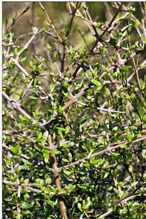
Caption: Waikanae Estuary.

http://nzpcn.org.nz/flora_details.asp?ID=1728