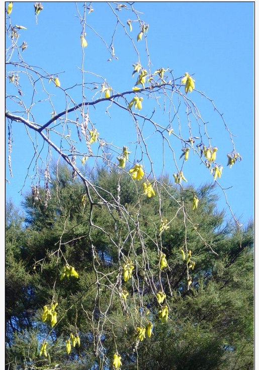
Caption: Sophora microphylla (Kowhai)