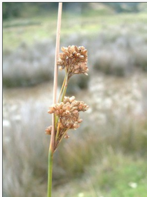
Caption: Close up of Juncus edgariae