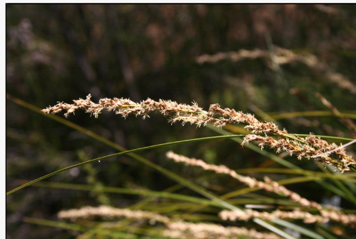
Caption: Flower of Carex virgata

http://nzpcn.org.nz/flora_details.asp?ID=1426