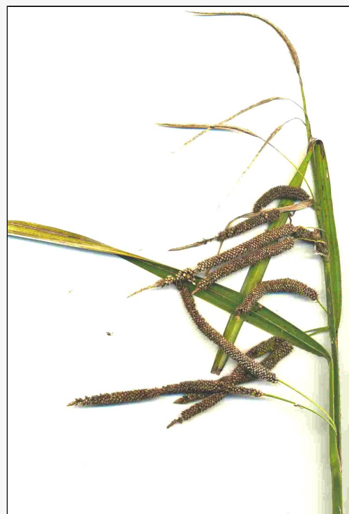
Caption: Seeds of Carex geminata Photographer: Wayne Bennett

http://nzpcn.org.nz/flora_details.asp?ID=1409