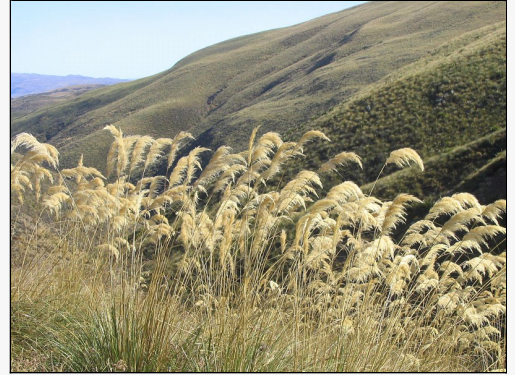
Caption: Kakanui Mountains, Otago