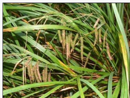
Caption: Coromandel, March - an unnamed carex allied to C. geminata s.s.