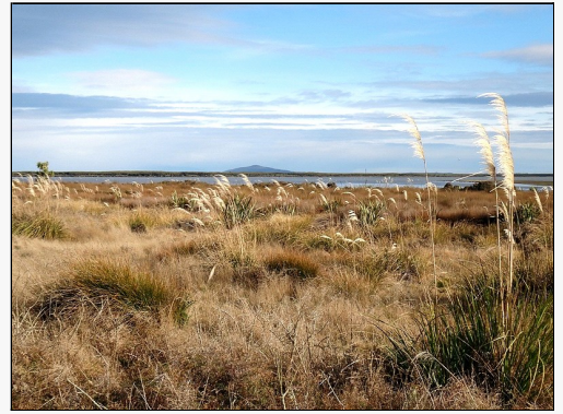
Caption: Waituna Lagoon, Southland

http://nzpcn.org.nz/flora_details.asp?ID=1758