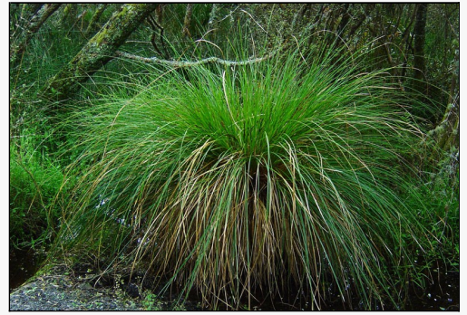
Caption: Carex secta

http://nzpcn.org.nz/flora_details.asp?ID=1418