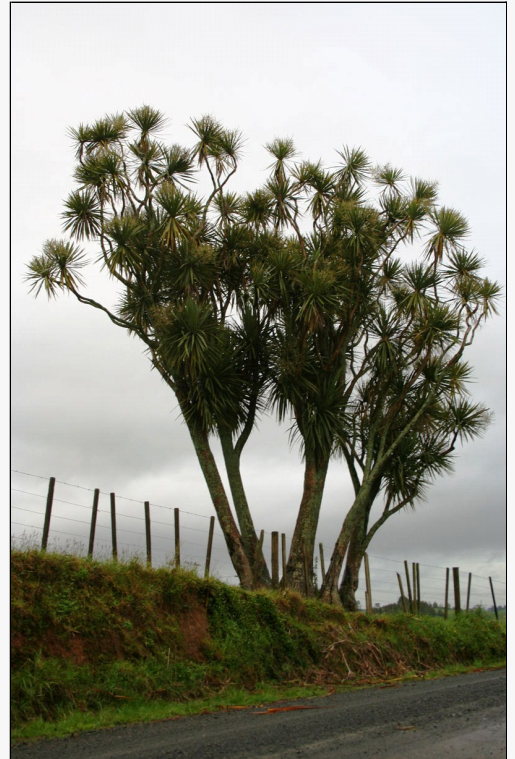
Caption: Cordyline australis