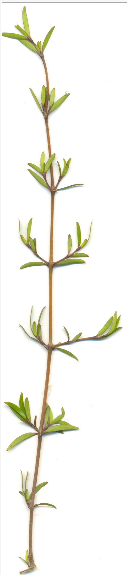
Caption: Coprosma propinqua var. propinqua