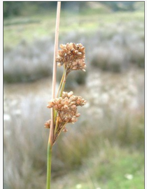
Caption: Close up of Juncus edgariae