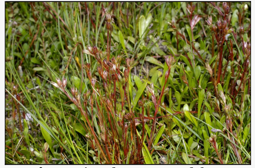
Caption: Miranda, Coromandel

http://nzpcn.org.nz/flora_details.asp?ID=3329