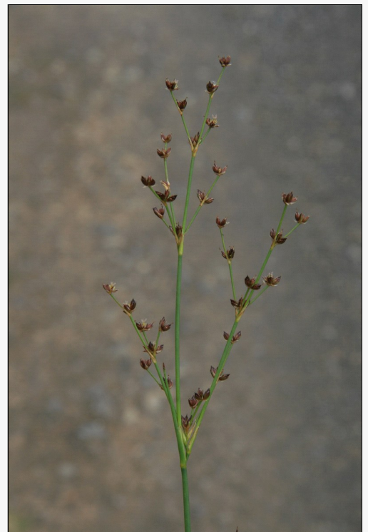
Caption: Juncus articulatus