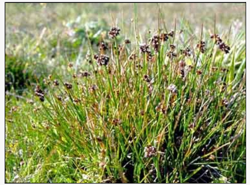
Caption: Whitiāu Scenic Reserve. Dec 1992.

Usually coastal. Growing in or near damp seepages, or on steep, damp cliff faces festooned with Blechnum blechnoides (Bory) Keyserl., Sonchus kirkii Hamlin, Machantia macropora Mitt. and Nostoc . Very rarely in dune swales or around the margins of brackish lagoons and streams. Also recorded on rock bluffs up to 500 m a.s.l.