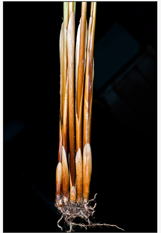
Caption: Base of plant showing leaf sheaths. Raumati. Feb 2011.

http://nzpcn.org.nz/flora_details.asp?ID=3335