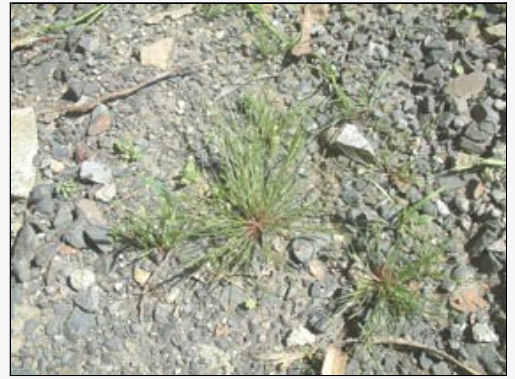
Caption: Juncus bufonius

http://nzpcn.org.nz/flora_details.asp?ID=4026