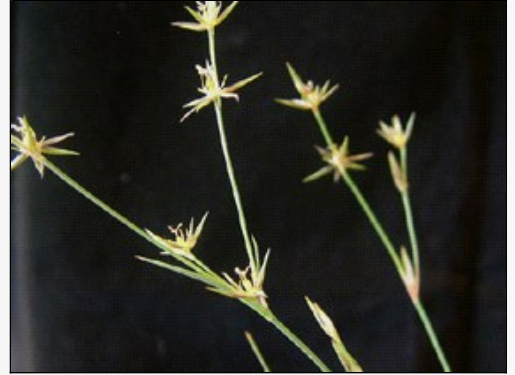
Caption: Juncus bufonius