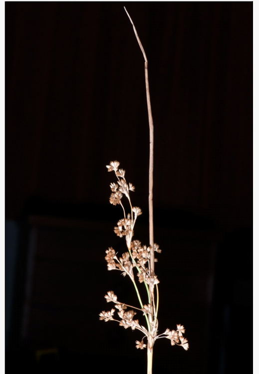
Caption: Inflorescence. Raumati. Feb 2011.