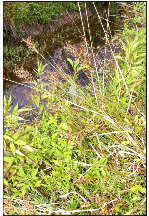
Caption: Juncus acuminatus

http://nzpcn.org.nz/flora_details.asp?ID=3321