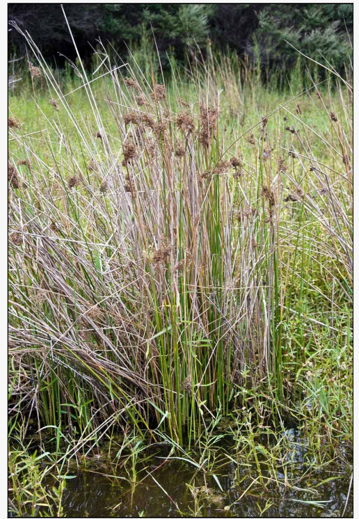
Caption: Lake Waiporohita. Feb 2011.

http://nzpcn.org.nz/flora_details.asp?ID=3343