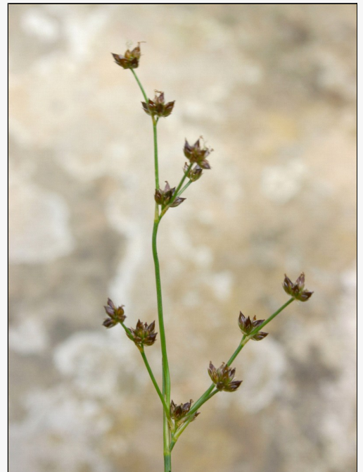
Caption: Juncus articulatus

http://nzpcn.org.nz/flora_details.asp?ID=3328