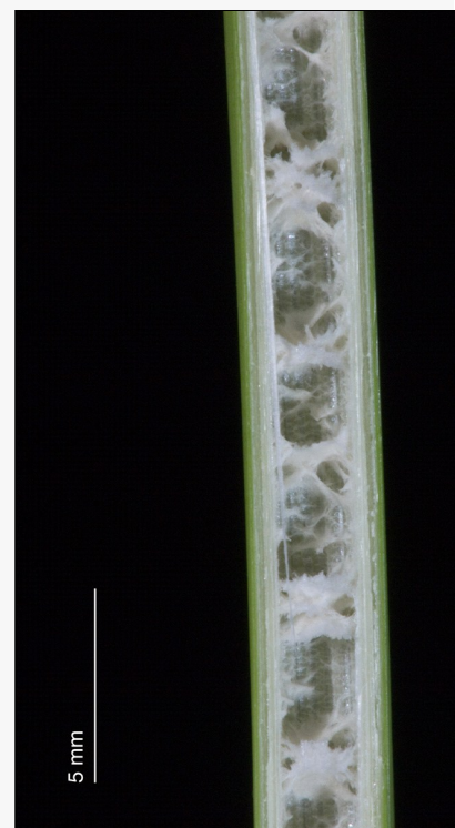
Caption: Stem section showing sparse pith. Waikumete Cemetery, Auckland. Oct 2007.