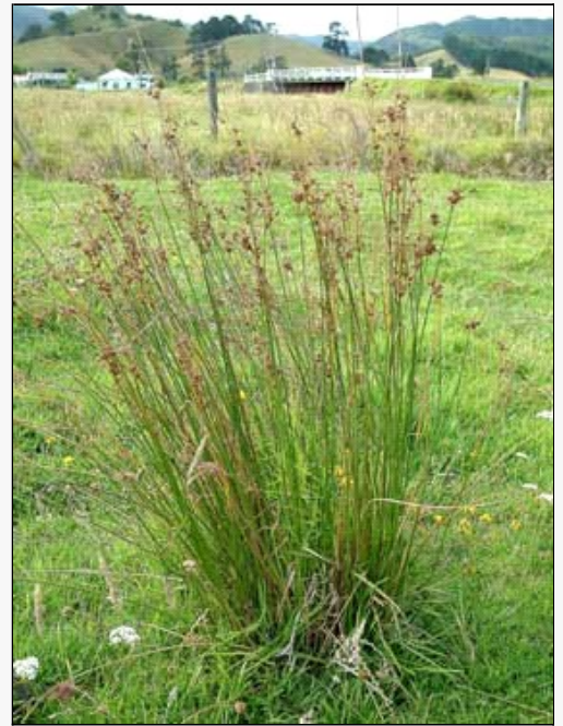
Caption: Juncus edgariae

http://nzpcn.org.nz/flora_details.asp?ID=869