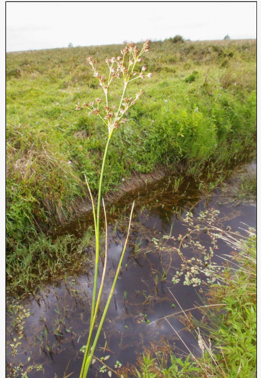
Caption: Juncus acuminatus