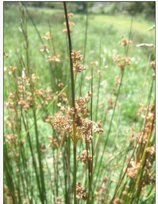
Caption: Juncus effusus