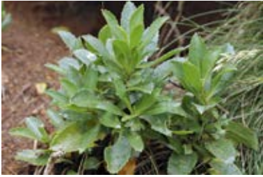
Lepidium juvencum .

Conservation Status: ‘Threatened/Nationally Endangered CD, DP, EF, RR’