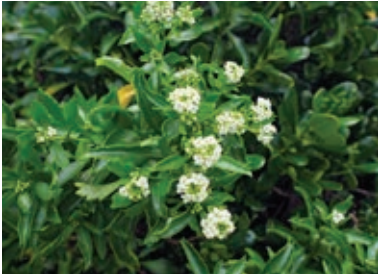
Lepidium oleraceum.