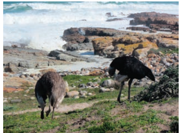
Ostriches browsing on shrubs beside the Atlantic Ocean, near the Cape of Good Hope.

Region, two-thirds of which are found nowhere else in the world; this compares with c. 2,580 for New Zealand, which is also considered to be a biodiversity hotspot. We saw too much to describe here, but, watching ostriches browse low-growing