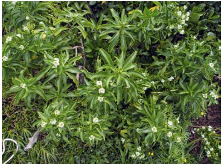
Lepidium oleraceum s.s.

A revision of the Cook's scurvy grass ( Lepidium oleraceum ) complex has now been published as a special issue of the open access journal Phytokeys (de Lange et al., 2013a—follow link below and you can download all 147 pages free!). The paper completes a revision that started 17 years ago following the chance rediscovery of 'Cook's scurvy grass' at Kaiangaroa Point, Rekohu (Chatham Island). In Threatened Plants of New Zealand (de Lange et al., 2010) and again in Trilepidea (de Lange, 2010) some of the new species now recognised were illustrated and briefly described under L. oleraceum . The Phytokeys paper