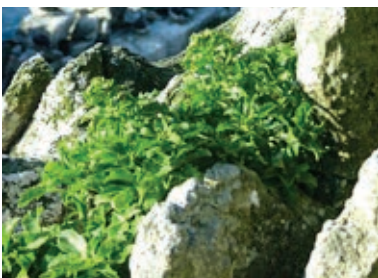
Lepidium seditiosum .

Conservation Status: ‘Threatened/Nationally Critical CD, IE, RR ’