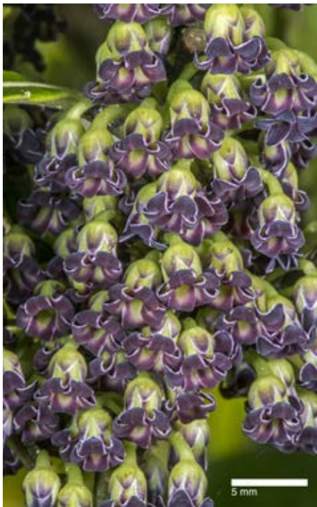
Melicytus lanceolatus at Belmont Regional Park.