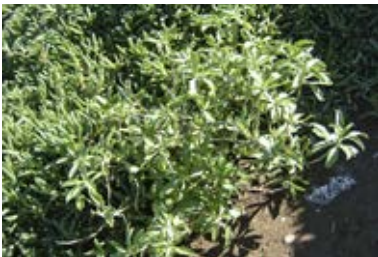
Lepidium aegrum .