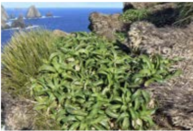
Lepidium limenophylax .

Conservation Status: ‘Threatened/Nationally Critical CD, DP, RR’