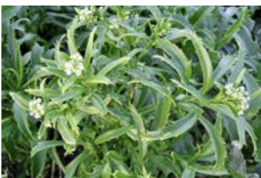
Lepidium castellanum.