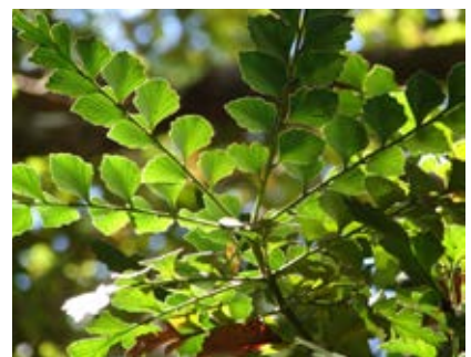
Phyllocladus toatoa at Awakino Scenic Reserve.

If you have images you would like us to add to the online collection, please email them to the Network ( info@nzpcn.org.nz ) or contact us to arrange to send a CD. Images that are accurately identified with a date and location are preferred.