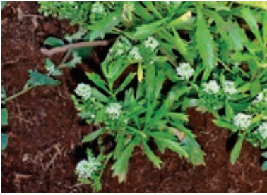
Lepidium panniforme .

Conservation Status: ‘Threatened/Nationally Vulnerable DP, EE, RR ’