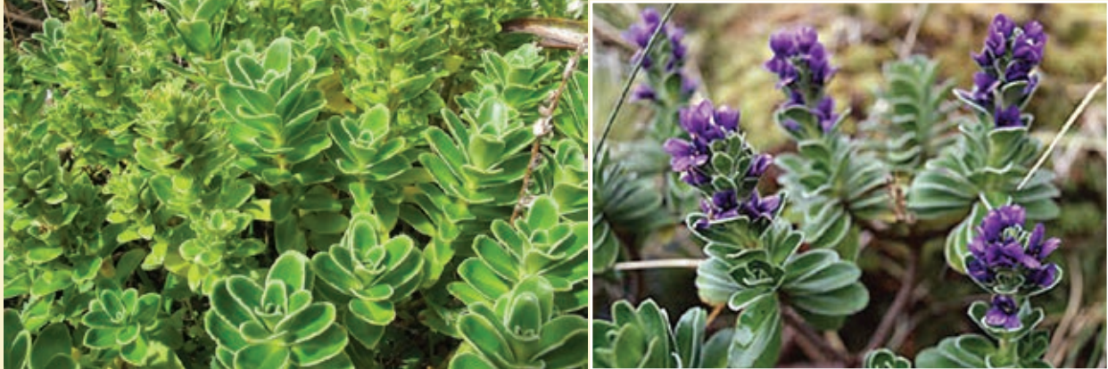
Hebe benthamii.

Plant of the month for September is Hebe benthamii , a Hebe named in honour of George Bentham (1800–1884). Bentham is considered one of the great botanists of the nineteenth century, known famously, among other endeavours, for the early taxonomic system known as the Bentham and Hooker system.