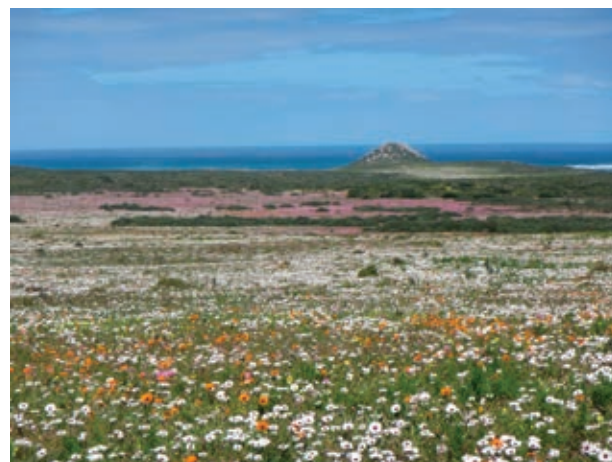
Dimorphanthea at Postberg Nature Reserve, north of Cape Town.

shrubs beside the Atlantic Ocean reminded me vividly of those reconstructions of moa browse, seeing natural areas reminiscent of exotic coastal gardens in New Zealand, with species such as pigsear ( Cotyledon orbiculata ), gazania, dimorphotheca , geranium ( Pelargonium spp.), protea, Leucadendron ; exploring the extensive Fynbos 1 vegetation associations, and observing many of our weeds in their natural environments, including climbing asparagus