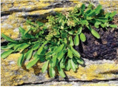
Lepidium oligodontum .