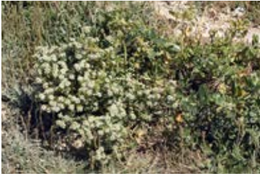
Lepidium crassum .