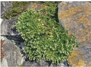
Lepidium rekohuense .

Conservation Status: ‘Threatened/Nationally Critical CD, DP, IE, OL ’