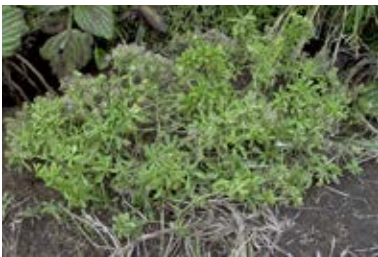
Lepidium oblitum .

Conservation Status: ‘Threatened/Nationally Critical CD, DP, RR’