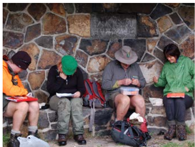
Figure 7: Cut test on seeds to see the quality of our seed collection.