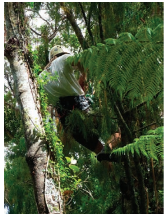
Figure 1. We were very grateful to have a skilled arborist on hand to collect seeds from tall rimu trees!