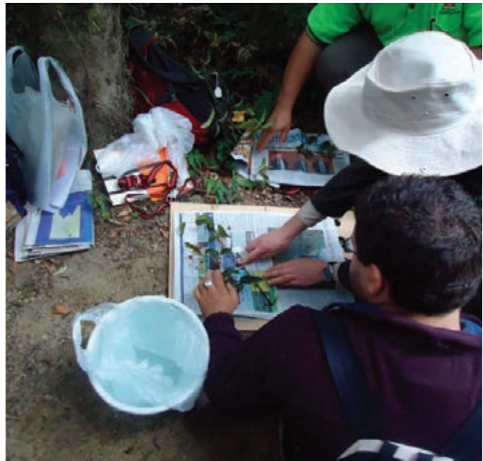
Figure 4: Taking a herbarium specimen in the field to assist with plant identification.

For the practical aspects of the training, four forest species, including kowhai, were used. The importance of seed banking as part of an ex situ conservation strategy in tandem with in-situ conservation, of identifying risks in the field and how to reduce these risks were all topics covered in the workshop.