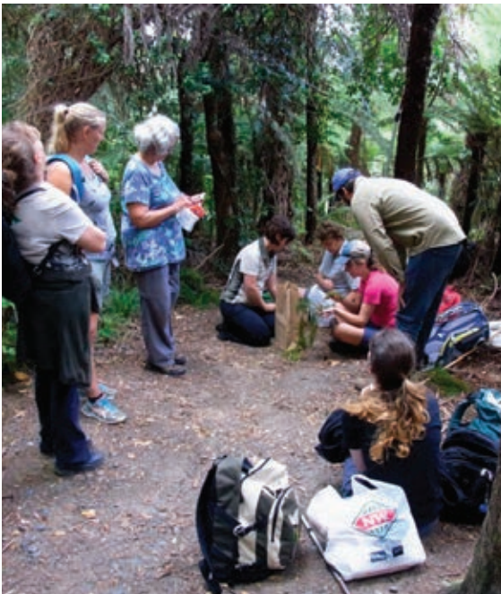
Figure 3: Time for a group de-brief!

Crassula mataikona may be more common than we think. Its small size means it can be easily over-looked and it can be confused with other native and exotic Crassula spp. To help spot the differences, see the Network factsheet for C. mataikona at: www.nzpcn.org.nz/flora_details.aspx?ID=742