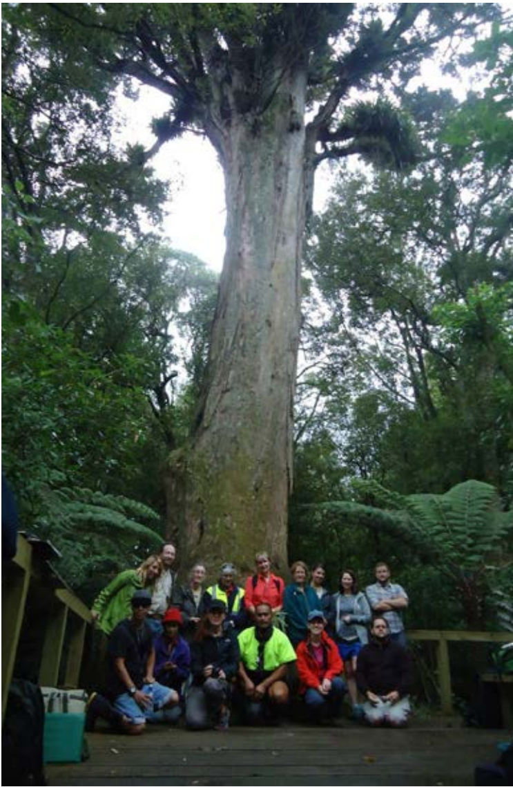
Figure 5: Palmerston North Seed Collector training participants under the mighty totara tree in the Manawatu Gorge.

Our third seed collector training workshop was hosted by the Christchurch Botanic Gardens, Hagley Park, Christchurch from 7 to 9 April. Pat Wood (from the Millennium Seed Bank Partnership, Royal Botanic Gardens, Kew) led the training with nine participants, including four people from the Department of Conservation, a Masters student, a teacher, and other interested people from the community taking part. The practical aspects of the training were undertaken in the Port Hills with two species collected. This workshop included presentations on how to identify likely recalcitrance (intolerance to drying) in seed, how to assess the feasibility of collecting from a population and the importance of gaining appropriate permissions before beginning any collection from the environment.