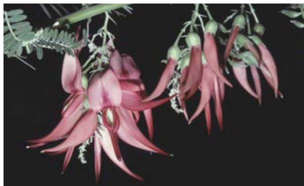
Clianthus puniceus.