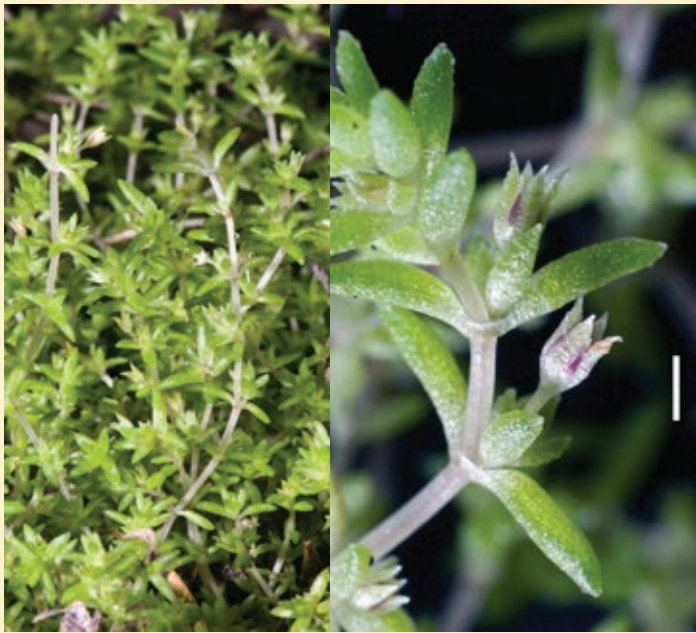
Crassula mataikona . Left: habit of plant. Right: flowers. Scale bar = 1 mm.

Plant of the Month for May is Crassula mataikona , a naturally uncommon succulent perennial found growing in open coastal habitat.