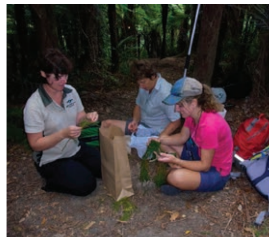
Figure 2: Removing fruits from rimu branches.