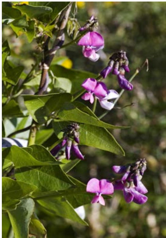
Dipogon lignosus .

Dipogon lignosus , common name 'mile a minute', is a perennial climbing vine of the legume family, native to the Fynbos biome of the Cape of South Africa, which has become invasive in the Australian-Pacific region. Dipogon is capable of very fast growth and can quickly smother indigenous native ground cover plants and also shrubs and trees, weighing them down and causing their branches to break. In New Zealand, Dipogon is designated as an unwanted organism and is banned from sale, propagation and distribution and is immediately eradicated when found (Popay et al. 2010). Dipogon is known to produce root nodules in its native South Africa but the bacteria involved have not been characterised.