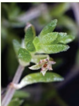
Crassula mataikona .