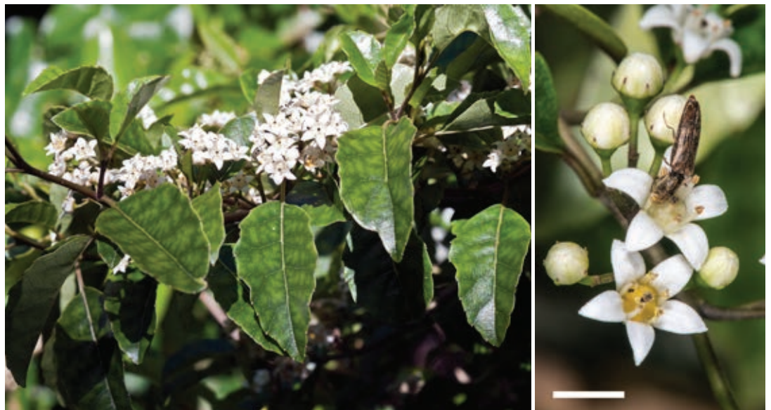
Carpodetus serratus : (left) the distinctive 'marble' pattern on the leaves; (right) a click beetle (Family: Elateridae) forages on Carpodetus serratus flowers. (Scale = 5 mm).

I have several marbleleaf planted at home and I think it makes a practical and beautiful specimen tree. Its tangled, radially symmetrical juvenile form is handsome and persists for about 3–4 years. The mottled leaves are a fine contrast to surrounding plants and the pale bark is very pretty. I can highly recommend growing this hardy, beautiful, fast-growing, sweet-smelling and often overlooked native tree.