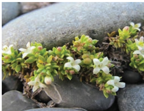
Possible new native Galium species.

The group proceeded to explore the area, pulling out some weeds and discovering some new native plants for the site: Hoheria angustifolia and shore dock Rumex neglectus , to add to the single wind-shorn Kunzea found recently in the covenant. Other highlights were the endemic Kaitorete broom, Carmichaelia appressa , a possible new species of Galium growing in bare shingle and the cushionfield of Raoulia australis and Scleranthus uniflorus . A small population of a diminutive Cardamine was also found in the shingle; this may be endemic to Kaitorete Spit and Banks Peninsula. Two orchids appear to be very local in the area: Thelymitra longifolia and Microtis . Canterbury boulder and common copper butterflies were quite numerous over several Muehlenbeckia species, along with a threatened tortricid moth Eurythecta robusta , which has a flightless female. The katipo spider was located nearby under driftwood, along with the introduced look-alike Steatoda capensis from South Africa.