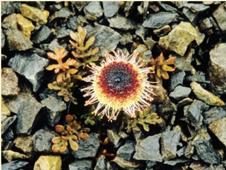
Leptinella atrata subsp. luteola .

Plant of the month for January is Leptinella atrata subsp. luteola . This interesting and beautiful yellow scree button daisy is found in sub alpine to alpine regions of eastern Marlborough and North Canterbury. It is known only from four locations: Black Birch Range, Mt Manukau, Kahutara Saddle and Mt Terako. Its habitat is sparsely vegetated mobile scree slopes.