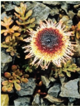
Leptinella atrata subsp. luteola .