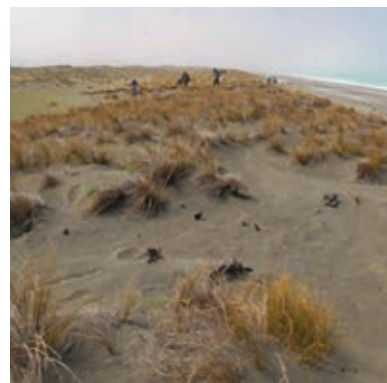
Foredunes with extensive pingao.

After lunch, we proceeded to Kaitorete Spit Scientific Reserve, where members radiated out to look for special plants, after stopping to view some Corokia cotoneaster shrubland. The endemic broom was joined here by a few plants of Carmichaelia corrugata (Declining), large areas of the diminutive grass Zoysia minima , and another local endemic, the undescribed Craspedia 'Kaitorete'. The possible new Galium species was also found here, this time growing in cushions of Raoulia australis . Locally abundant low shrubs of Pimelea prostrata were in flower and covered in butterflies (southern blues and boulder coppers), flies, and small wasps. The foredunes contained large patches of Carex pumila and a small colony of akeake, as well as diminishing numbers of yellow lupin, thanks to ongoing weed control by DOC. The group was surprised to see sheep grazing the reserve, and wondered what impacts the elevated soil fertility and disturbance might be having on the native plant community.