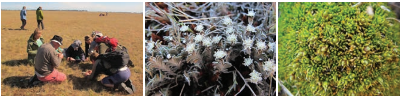
Botanising at Waihora Scientific Reserve. Fan-leaved mat daisy Raoulia monroi . Colobanthus brevisepalus .

Vulnerable), Raoulia monroi (Declining), bright green cushions of Colobanthus brevisepalus (Naturally Uncommon), and the cryptic Leptinella serrulata (Naturally Uncommon). In addition, a suite of locally uncommon plants such as Acaena buchananii , Vittadinia australis , Convolvulus waitaha , Dichondra repens , Muehlenbeckia axillaris , Carex resectans , and the exotic Isolepis marginata were found over a small area. This site also appeared to be grazed, with the result being elevated fertility and the possible loss of native species over time. Only on the most shingly dry sites were native dry grassland species thriving, with the rest of the site dominated by exotic species. The group felt that it would be useful if ongoing monitoring was initiated to determine the effects of grazing on native plants in the reserve. Soon it was 5:30 p.m. and time to head home after an amazing day of comradery and discovery on Kaitorete Spit; undoubtedly one of the most special and important parts of our coastline nationally.