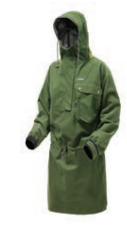
A jacket similar to the one donated by Swazi New Zealand