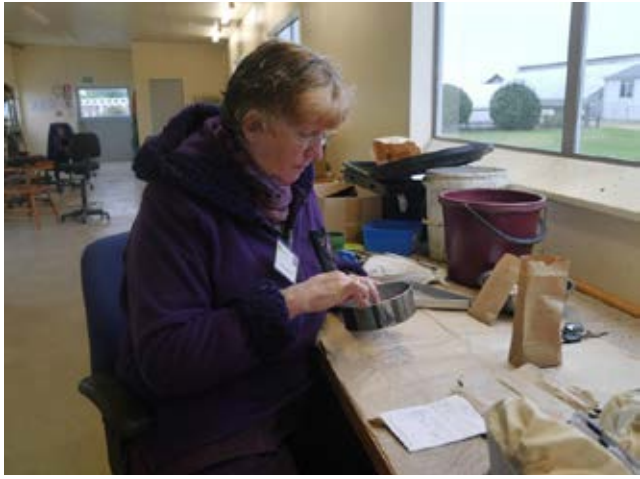
from Otari-Wiltons Bush) from debris.