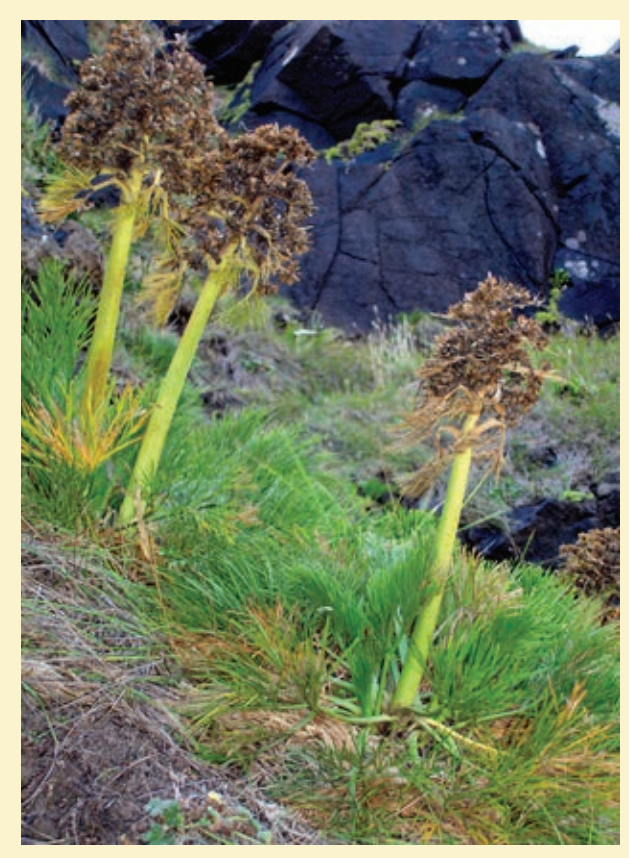
Aciphylla dieffenbachii.

Plant of the month for July is Aciphylla dieffenbachii. A member of the carrot family (Apiaceae), this Aciphylla is quite unlike many other species of the genus, with softer flaccid leaves rather than the familiar stiff, needlelike leaves of its relatives (often distressing if stumbled upon with bare knees while tramping). Naturally occurring only on the Chatham Islands, A. dieffenbachii has become popular in gardens in New Zealand, growing best in a free draining soil in the sun; great for breezy coastal areas. Unfortunately it is classified as Threatened—Nationally Vulnerable and, in the wild, it is now restricted to steep, usually south facing, cliffs, rock scarps, ledges and colluvial slopes. Domestic stock and feral mammals are the main threats to its survival.