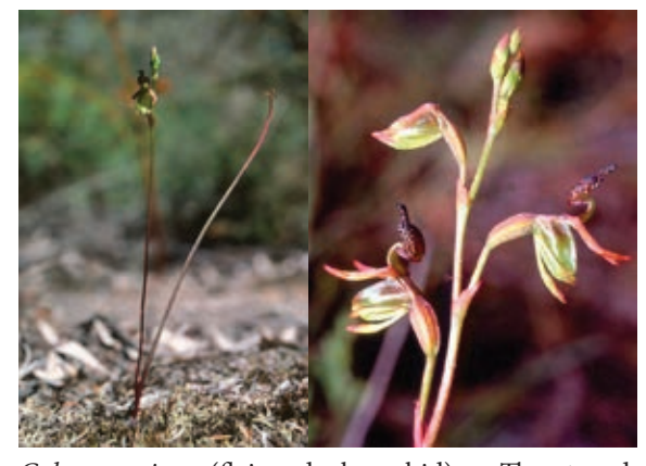
Caleana minor (flying duck orchid), a Threatened: Nationally Critical species restricted to one site in New Zealand, (left) plant in flower; (right) close-up of flowers showing their resemblance to flying ducks.

In contrast to this rarity, New Zealand's most widespread orchid is the common onion orchid ( Microtis unifolia ), named after its onion-like tubular leaf. This species is found both in the wild and in pastures, lawns, and urban areas. Spider orchids ( Nematoceras and others) are named after their flowers that have long and slender spider-like sepals.