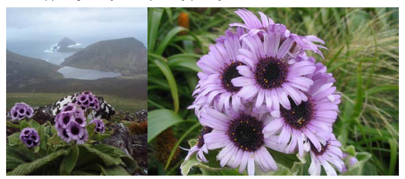
Pleurophyllum speciosum, Campbell Island.

The 2015 Favourite Plant and Worst Weed election has come to an end. Voting for your favourite New Zealand plant and worst weed was run through November after being kicked off at the Dunedin Conference. The 13th annual competition for favourite plant was anyone's guess at the start of the vote, but quickly became a one horse race. Earning 25% of the vote, the winner of the 2015 Favourite Plant as voted by you is giant emperor daisy, Pleurophyllum speciosum .