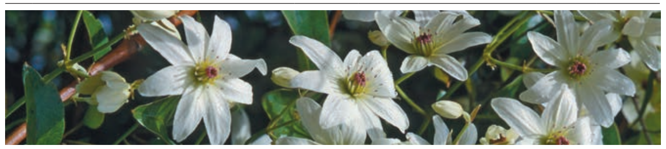
Clematis paniculata was New Zealand's fifth favourite plant for 2015.