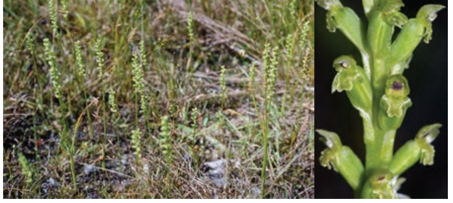
Microtis unifolia (the common onion orchid). Left: colony of plants. Right: close-up of green flowers.