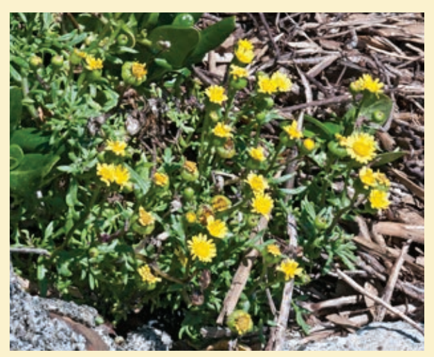
Senecio sterquilinus.

Plant of the month for December is Senecio sterquilinus , an endemic herbaceous daisy from the coast. It can be found in the North, South and Chatham Islands, however, it is very restricted in its range, usually found around guano rich sea bird nesting grounds or seal haul outs, earning it the common name of guano groundsel. An annual or short lived perennial, it grows into a sprawling plant up to 0.6 \text{ m} \times 0.6 \text{ m} . In summer, the large yellow flower heads often completely cover the plant, giving it great horticultural potential. It can be confused with Senecio lautus , but differs in having a larger overall stature, a