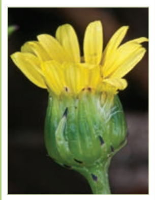
Senecio sterquilinus.