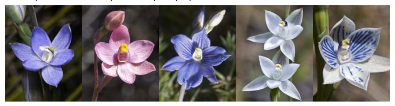
Sun orchids from left: Thelymitra aemula , Thelymitra carnea , Thelymitra cyanea , Thleymitra longifolia , Thelymitra pulchella .

The sun orchids, Thelymitra , named because some only open in warm weather, have relatively simple star-shaped flowers that may be white, pink, purple, blue, or other colours.