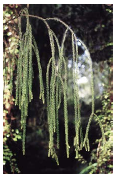
The drooping foliage of a juvenile rimu, Dacrydium cupressinum.