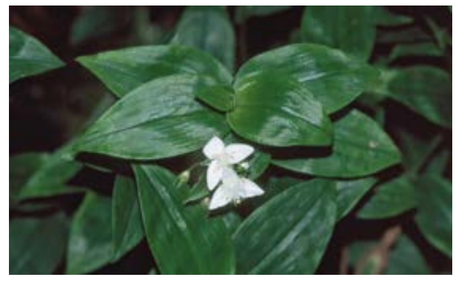
Tradescantia fluminensis Stokes Valley.