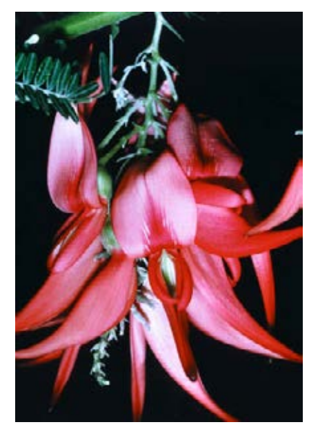
Clianthus puniceus in cultivation.

Shaun wrote: "It's a Kaipara native like me and it needs as much help as we can give it."