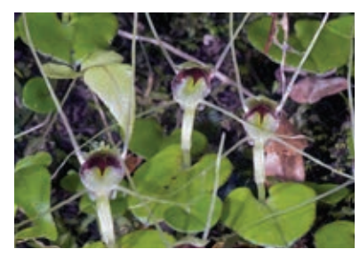
Nematoceras "whiskers" (spider orchid), an informally named entity that is nevertheless well known, showing four long and whisker-like petals and sepals.