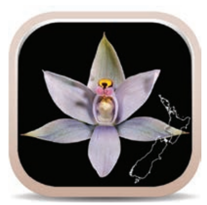
The icon of the New Zealand Orchid Key app featuring the mauve sun orchid ( Thleymitra malvina ).

A new New Zealand Orchid Key app for identifying New Zealand's native orchids is available as a free download for smartphones and tablets from the Android Google Play Store and Apple's iTunes. The app is easy-to-use, has lots of colourful photographs, and covers a wide array of plant characters, including leaves, flowers, habitats, and distribution—all of which are explained by fact-sheets built within the app. All of the 120–160 species of native orchids in New Zealand are covered, including those that don't yet have formal botanical names. Scientists have at times debated the classification of our native orchids (especially at the genus and tag-name levels), and research is ongoing.