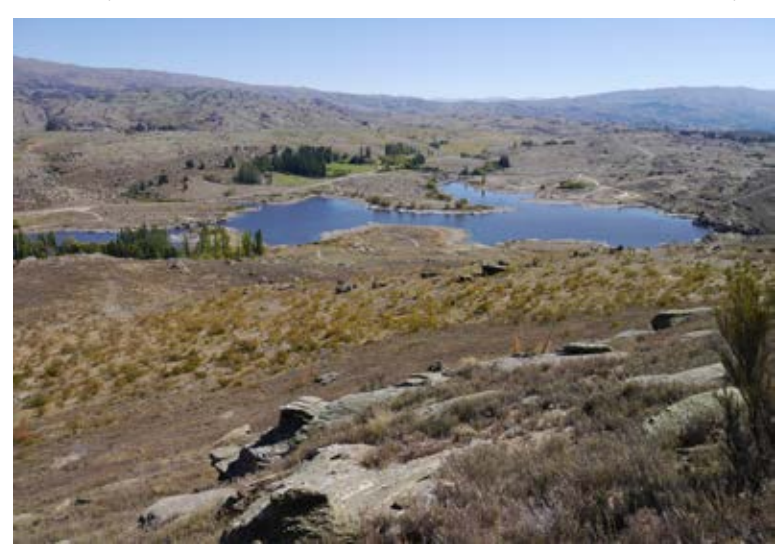
View from Flat Top Hill, Central Otago.