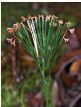
Schizaea dichotoma .