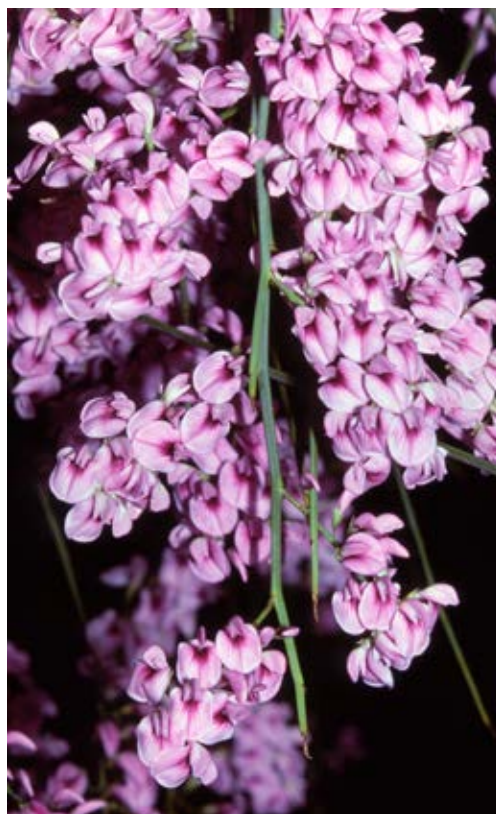
Pink broom ( Carmichaelia carmichaeliae ).

More often than not New Zealanders’ knowledge of native plants is that of iconic, brightly flowered, common species. It’s the New Zealand Plant Conservation Network’s role to remind people that all we are is thanks to plants. We eat them (or things that eat them), they provide environmental services like clean air and water, shelter and soil stability, yet plants of any nature continue to be taken for granted. Native plants in trouble is a more and more common situation in New Zealand. With threats arriving from overseas, such as myrtle rust, we find more of our species joining the list in our most recent Threat Classification with all threat categories growing since 2012. To protect our native flora, we need to protect their environment. Ongoing land use changes and “accidental removal” of plants only continues to degrade the status of our flora.