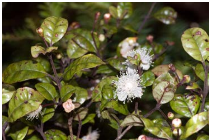
Ramarama ( Lophomyrtus bullata ).

The present leader, a species relatively common in North Island but not so much in the South Island, often used by florists in their arrangements because of its very interesting and unique leaves is Lophomyrtus bullata , ramarama, is a member of the widely endangered Myrtaceae. From all accounts, this species is the most susceptible to Puccinia psidii , myrtle rust. Voters reasons for this species are summarised by the following comments: