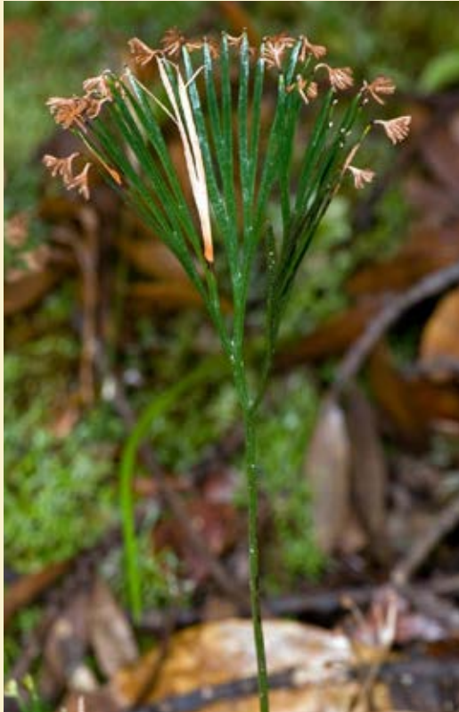
Schizaea dichotoma .

The plant of the month for November is Schizaea dichotoma , one of four Schizaea species native to New Zealand. The species is found in the northern North Island, from Te Pahi to Taupo, and on Raoul Island in the Kermadec group. It is mostly associated with lowland kauri/podocarp forests and geothermal areas but is sometimes found in other forest types. In kauri forest, it is often found growing in the thick layer of kauri litter at the base of large trees. The small plants consist of short creeping underground rhizomes with fronds emerging from the ground. The bright green sterile portion of the fronds is 60 mm to 460 mm tall and divide dichotomously 3–7 times to form a flattened fan. The fertile portion of the fronds is small (<10 mm), pinnately divided and has the appearance of small brown flowers at the tips of the sterile portion of the fronds. In New Zealand, this species is easily distinguished from other Schizaea by its distinctive flattened fan shaped fronds with terminal fertile laminae at the surmounted on the tips of the sterile portions.