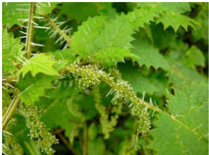
Ongaonga ( Urtica ferox).

Presently sitting in third place, although this plant is not threatened like the others featured here, it is usually remembered for the wrong reasons by all who meet it. Unless you see it first, Urtica ferox , ongaonga, tree nettle will give you a painful lingering sting. That said, it is also a very important species to our endemic Vanessa gonerilla , red admiral butterfly. The comments below give an idea of why it sits in third place: