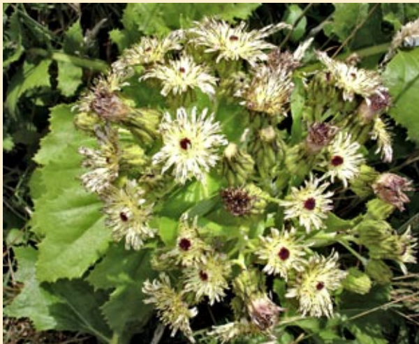
Embergeria grandifolia .

Plant of the Month for December is the Chatham Island sow thistle, Embergeria grandifolia , which is endemic to the Chatham Islands where it can be found growing along the coast on sand dunes and cliff ledges, sometimes just a few metres from the ocean.