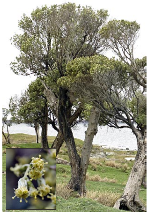
Olearia telmatica . Inset: close-up of flowers.

Critical study soon revealed numerous morphological differences and these were backed up by the use of AFLP DNA fingerprinting that showed the species are distinct from each other and apparently not hybridising. Both shell akeake and akeake are regarded as threatened (rated “Nationally Vulnerable”) due, the authors believe, to widespread recruitment failure and loss of habitat. It is observed that akeake forest (a distinct vegetation type) is close to being functionally extinct on the main islands of the Chatham group.