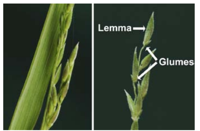
Above: Leaf and inflorescences of Simplicia from Kawhatau, December 2009. Parts of newly emerged inflorescence (left); previous summer's inflorescence, with the tiny and unequal glumes indicated (right).

In the January issue of Trilepidea , the featured Plant of the Month was Simplicia laxa . In that article it was stated that "Although found in Wairarapa in 1880, it has not been seen in the North Island since then and is currently known only to be in several small populations in Otago." In the latest