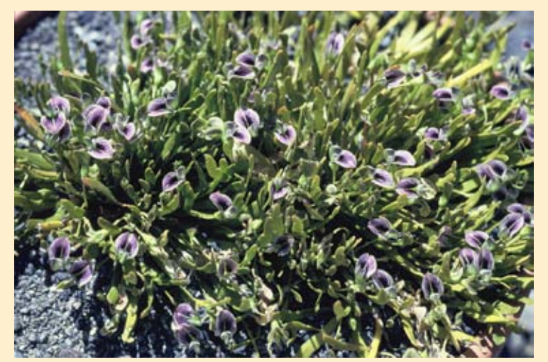
Carmichaelia corrugata.

Plant of the month for May is Carmichaelia corrugata (common dwarf broom). This low growing broom is endemic to Marlborough, Canterbury and Otago in the South Island. It grows on well-drained gravel and sandy soils in disturbed, sparsely vegetated sites such as river beds and river terraces. It really is a beautiful plant, forming low dense mats to about 1 m wide with purple flowers appearing from October to May. Carmichaelia corrugata can be propagated by seed and cuttings