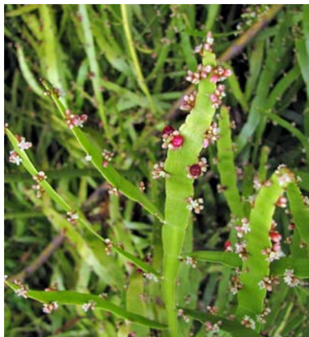
Fig. 1. Phylloclades, clusters of flowers and mature fruits of the ‘tape-worm plant’ Muehlenbeckia platyclada (F.Muell.) Meisn.