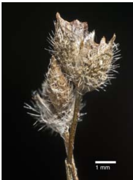
Fig. 2. Centrolepis strigosa inflorescences showing the paired, unequal bracts.