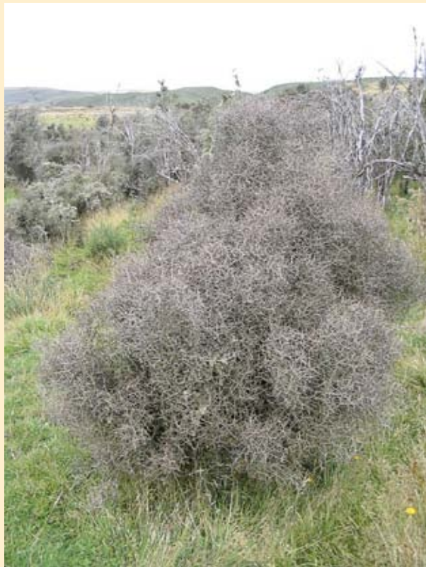
Melicytus flexuosus .

Plant of the month for January is Melicytus flexuosus . This is a divaricating shrub that can reach 5 m tall with dark interlacing, almost leafless branches. The sparse linear shaped leaves are dark green or brown-green, on branches pitted with tiny white spots. Strongly perfumed, the pale yellow flowers appear in August to November and make this plant a worthwhile addition to your garden. Unfortunately, M. flexuosus is not often commercially available, but seems to grow well in gardens with conditions similar to where it is found in the wild.