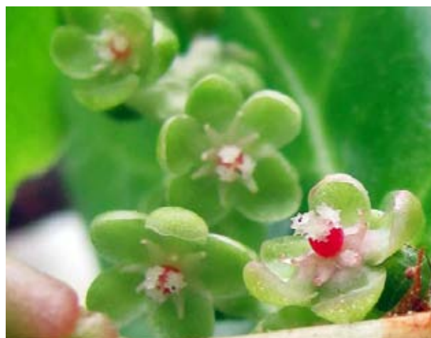
Fig. 2. Female flowers of Muehlenbeckia adpressa (Labill.) Meisn. from Green Cape, Australia, with non-functional staminodes lacking anthers.