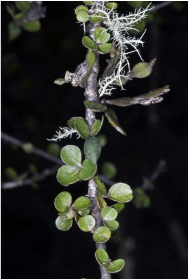
Pittosporum obcordatum.