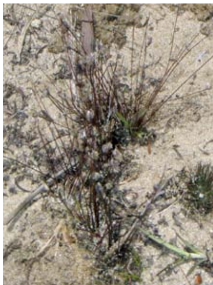
Fig. 1. Centrolepis strigosa in the wild at Lake Waikare, Kai Iwi Lakes.

Centrolepis strigosa is a rather unassuming, tufted hispid plant of open, lowland sandy soils. It is very easily overlooked except (possibly) when it is in flower and/or fruit (Fig. 1). As noted by Moore & Edgar (1970) and Healy & Edgar (1980), the flowers are borne on a wiry, 10–70 mm long scape as a terminal “complex” set within two opposite, unequal glume-like bracts (Fig. 2). Usually there are 4–8 pseudoanthia (i.e. partial inflorescence) per bract, each furnished with three hyaline fringed bracteoles, sheathing the solitary male flower and accompanying 4–8 female flowers. The foliage (Fig. 3) comprises a dense tuft of filiform blue-green, red-green to dark green hispid leaves, all of about equal length (10–30 mm long), the lamina of which broadens at the base and has a distinct acicular apex.